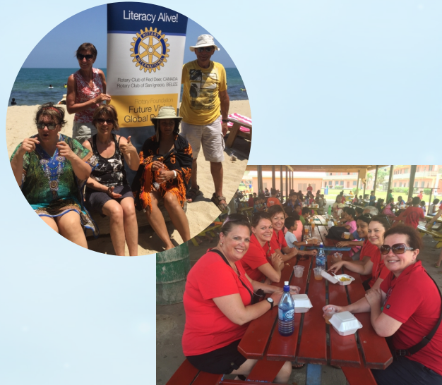
Teacher Team from 2016

Voluntravel Team Members support the Vocational Training Teams in assisting them to provide literacy coaching.